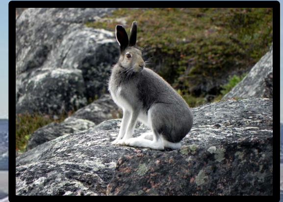
In the summer