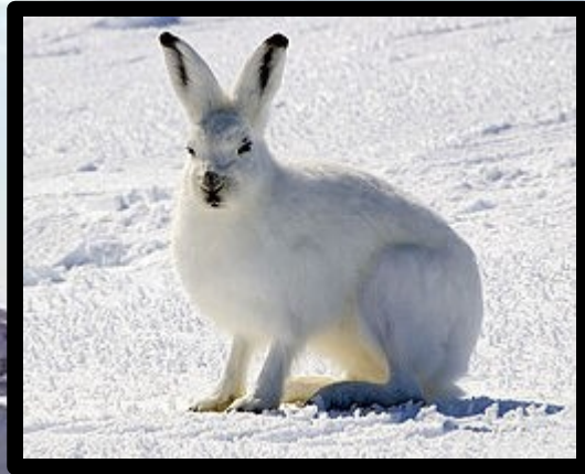
In the winter.

This is why it has a white coat in winter and a brown coat in summer. The Arctic Hare has big ears, big hind legs to run faster. These features help it to survive in its environment because there are predators like arctic foxes, polar wolves and gluttons.